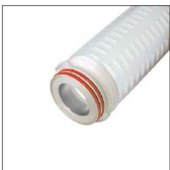
226 (w/SS Insert)