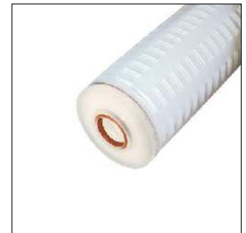
213 Internal O-Ring