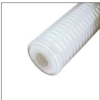
Flat (for 213)