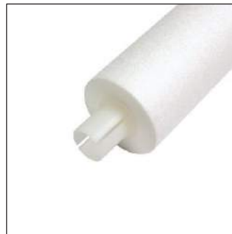
PP Core Extender