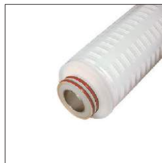
222 (w/SS Insert)